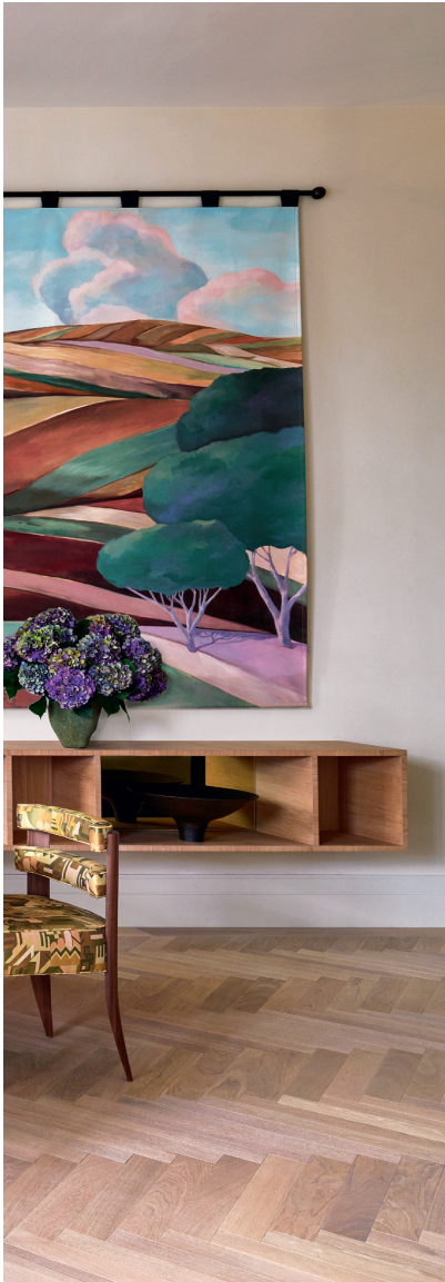
PHOTOGRAPH: Paul Raeside